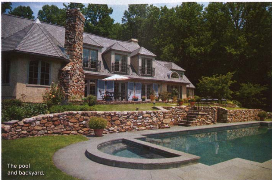
The pool and backyard.

"Rather than casement windows, Jeff suggested that we add two sets of French doors in the dormers to match the sets of French doors below," says Kass. "It not only looks great but also brings so much natural light into the room."