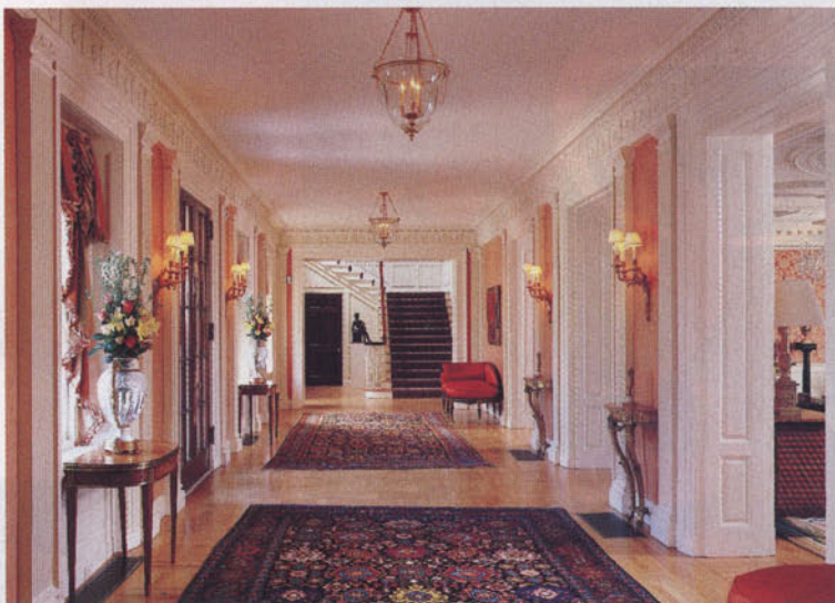
DECK THE HALLS: "In hallways, you have to vary the element heights to give you lots of different sight lines," Eberlein says. OPPOSITE: The Louis XV sofa in this feminine guest room, found by Eberlein through a dealer in Paris, is framed by exuberant drapery, including a shirred Austrian shade. The carpet is Aubusson, circa 1900.