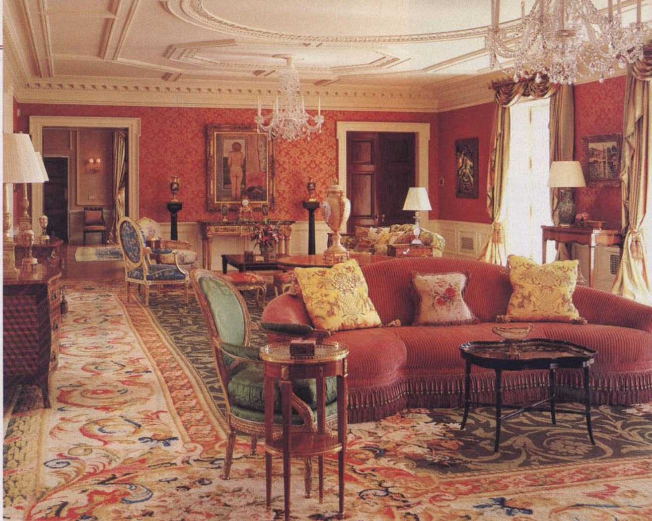
HAVING A BALL: Eberlein fashioned the 40-foot-long Continental salon-style ballroom (above) around the centerpiece of a 19th-century English Axminster rug. The nude on the far wall is by Pierre Bonnard.