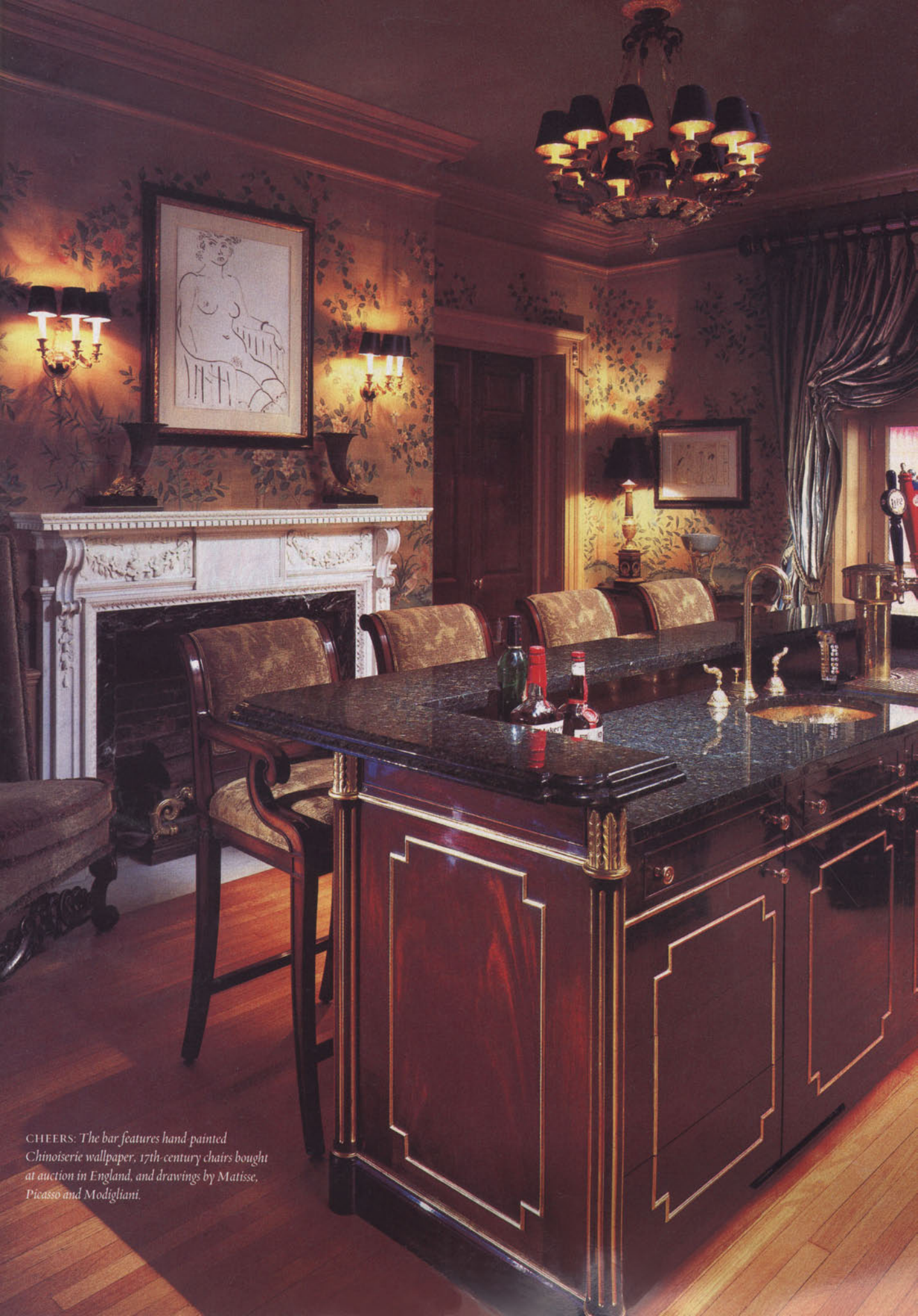
CHEERS: The bar features hand painted Chinoiserie wallpaper, 17th-century chairs bought at auction in England, and drawings by Matisse, Picasso and Modigliani.