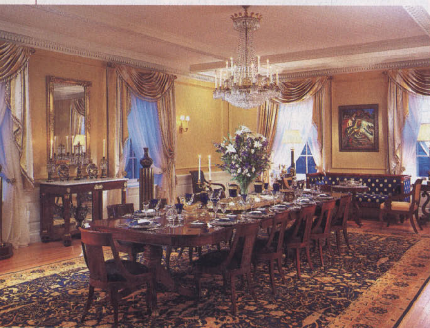
DINNER IS SERVED: None of the furniture in the neoclassical dining room dates from before 1810 or after 1828, including the horsehair-upholstered chairs. The carpet is Indian, made in the early 20th century.

house says, with a wry smile. "I originally was going to update the kitchen and put in four new boilers." The house, which sits high on a hilltop and has eastern views, was originally designed by architect Horace Trumbauer, who also designed the Philadelphia Museum of Art and the Scott estate, Ardrossan. It is the sort of mansion the Lords rambled about in The Philadelphia Story . The owner, who prefers to remain unnamed, is in his early 30s, but despite his youth, he fell in love with the home's crown moldings, African mahogany doors and elegant, oversize rooms.